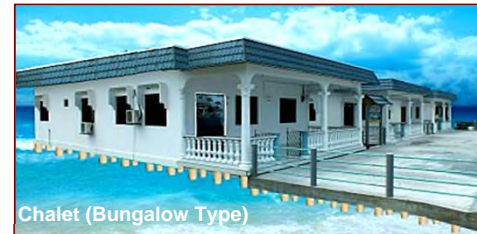
Chalet (Bungalow Type)