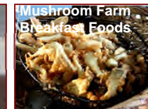
Mushroom Farm Breakfast Foods