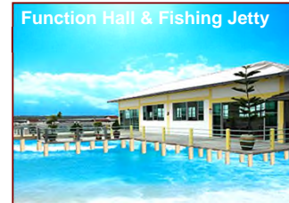
Function Hall & Fishing Jetty