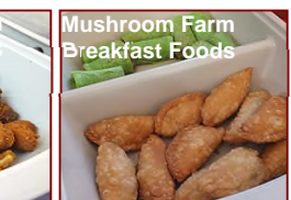
Mushroom Farm Breakfast Foods