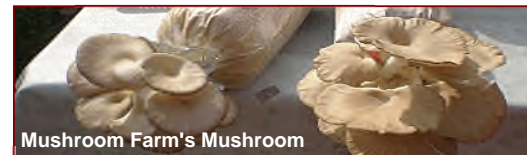
Mushroom Farm's Mushroom