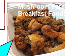
Mushroom Farm Breakfast Foods