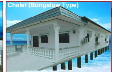
Chalet (Bungalow Type)