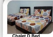
Chalet D Bed