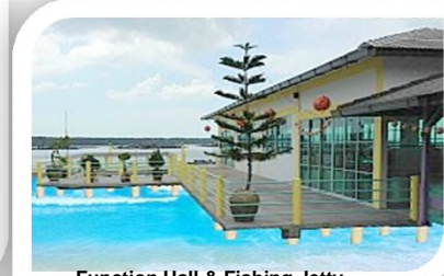
Function Hall & Fishing Jetty