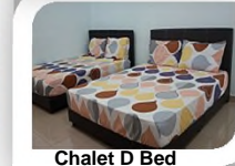
Chalet D Bed