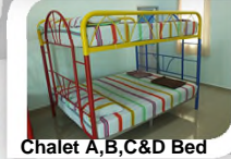
Chalet A,B,C&D Bed