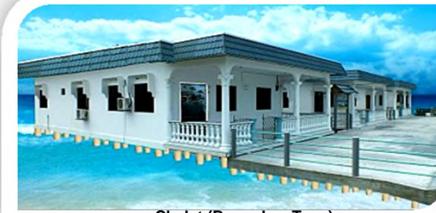
Chalet (Bungalow Type)