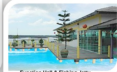
Function Hall & Fishing Jetty