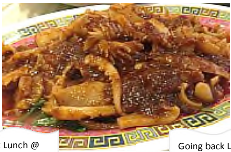
Going back Lunch @ Pontian Restaurant