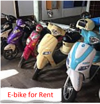
E-bike for Rent