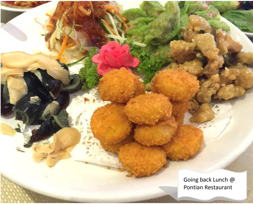
Going back Lunch @ Pontian Restaurant