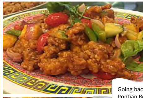
Going back Lunch @ Pontian Restaurant