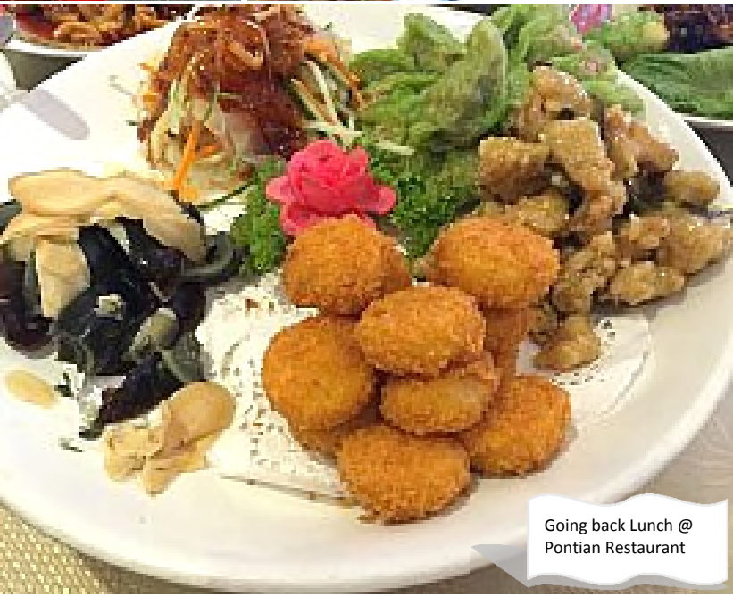
Going back Lunch @ Pontian Restaurant