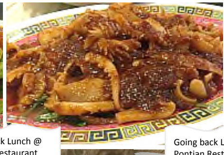
Going back Lunch @ Pontian Restaurant