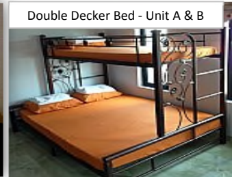
Double Decker Bed - Unit A & B