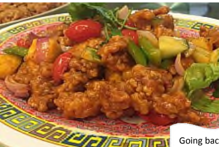
Going back Lunch @ Pontian Restaurant