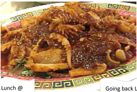
Going back Lunch @ Pontian Restaurant