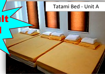
Tatami Bed - Unit A