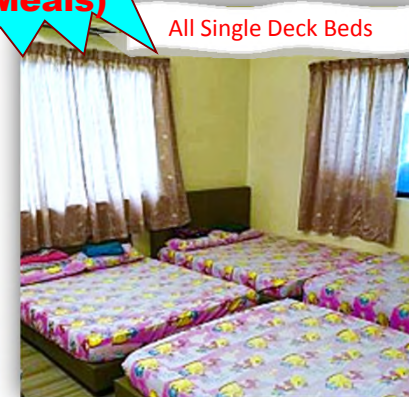
All Single Deck Beds