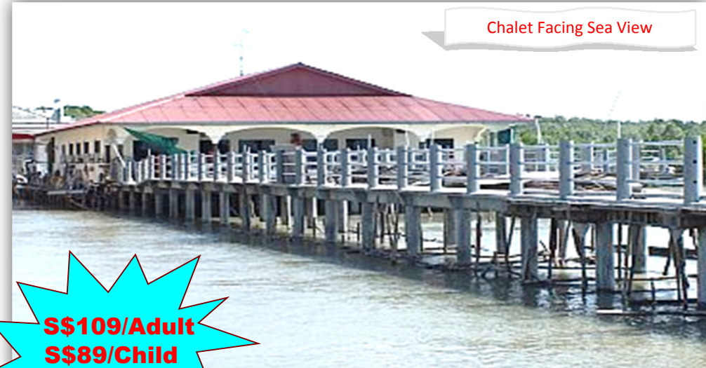
Chalet Facing Sea View