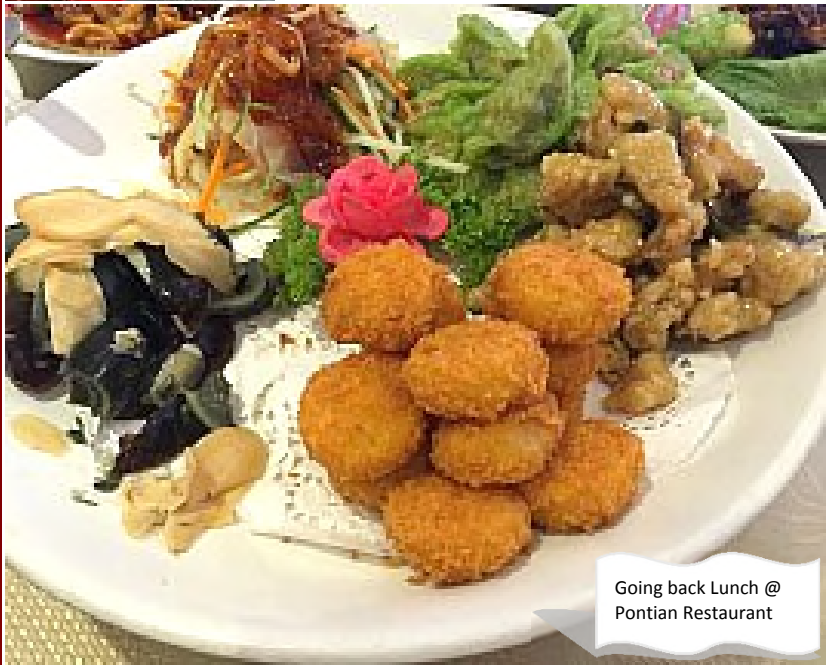
Going back Lunch @ Pontian Restaurant