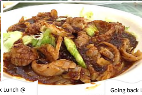
Going back Lunch @ Pontian Restaurant