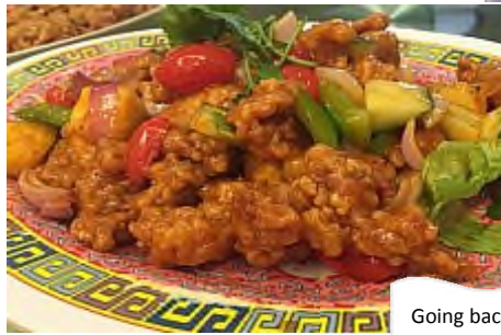
Going back Lunch @ Pontian Restaurant