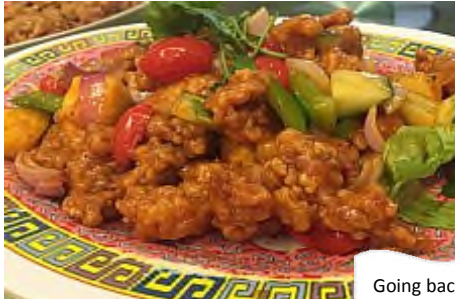
Going back Lunch @ Pontian Restaurant