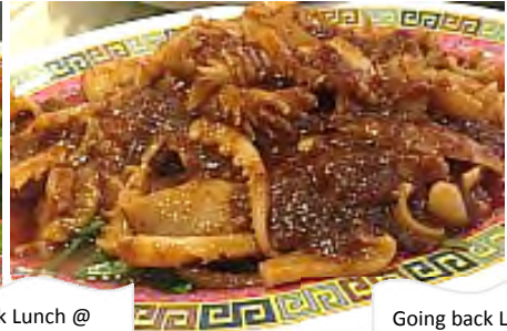
Going back Lunch @ Pontian Restaurant