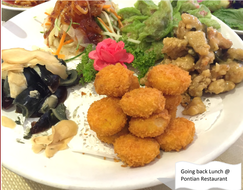
Going back Lunch @ Pontian Restaurant